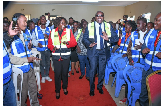
Governor Mbarire and Deputy Governor Kinywa Mugo after providing Youth Climate Action Fund to Embu Youth