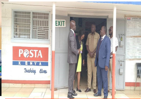
Kenya Postal Cooperation and County Government Partnership