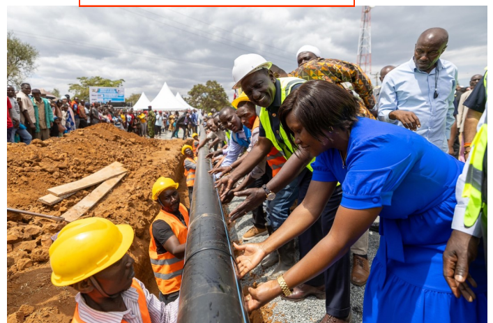
Launch of Iriari Water Project