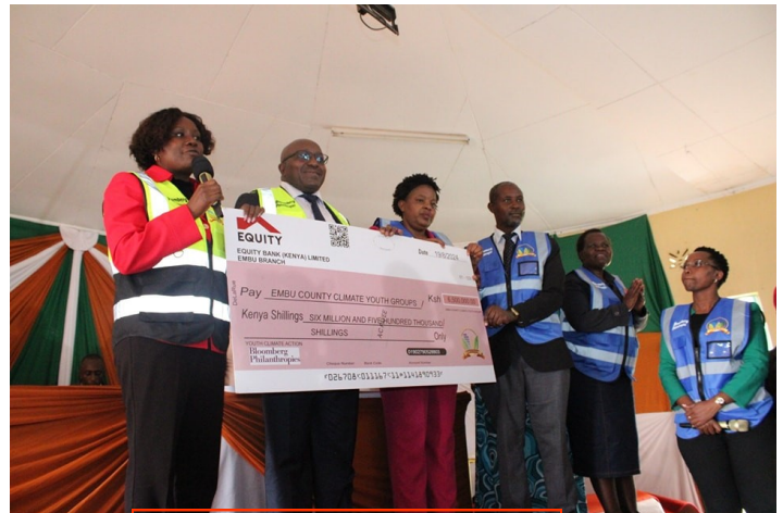
Embu County Government Publication