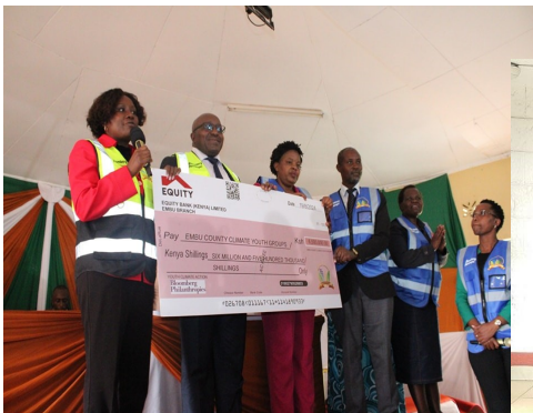
Governor and Deputy Governor issuing 6.5M to climate youth groups