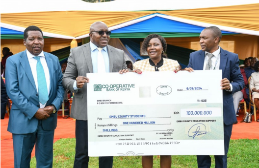
Governor Issuing Bursary to Students