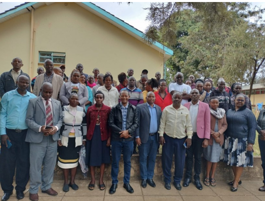
Farmers Trained on Sustainable Land Management

Embu farmers have been trained on sustainable land management practices for small-holder farmers build smart agriculture skills. This in turn will lead to higher crop yields, increased income and food security, and resilience to a changing climate.