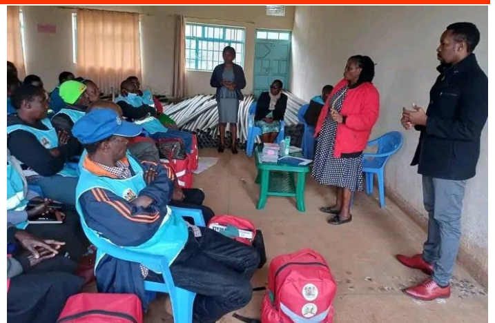
Training of Community Health Promoters