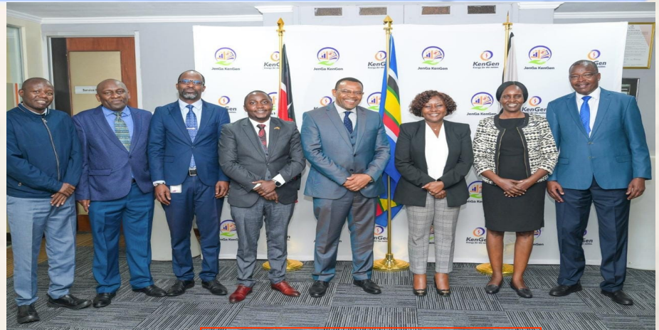
H.E The Governor with the KenGen Staff