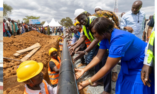
Launch of Iriari Water Project