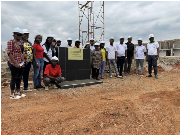
Trade staff at the launched CAIP

M anufacturing sector plays a key role in economic development, employment creation; offer new products to market; provide stimulus for growth of the agriculture sector and offer significant opportunities for export expansion. The sector performance has stagnated at around 7% in the last couple of years. According to Economic Survey 2023, the contribution to Gross Domestic Product was 7.8% in 2022 which was a slight improvement from 7.2% in 2021. In this regard, Embu County Government in partnership with the National Government is currently constructing County Aggregations and Industrial Parks as a way of promoting value chains approach.