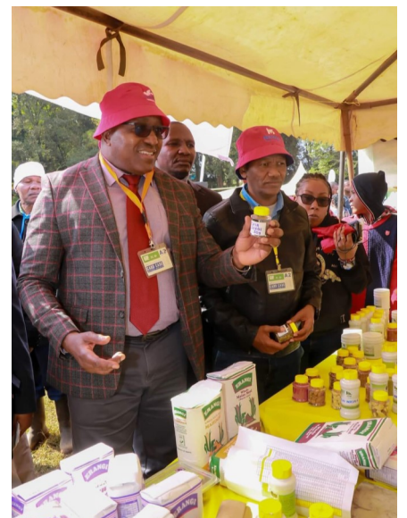
Deputy Governor touring Exhibition Stand, Kairuri

Coincidence OR Not??? If... A B C D E F G H I J K L M N O P Q R S T U V W X Y Z Equals... 1 2 3 4 5 6 7 8 9 10 11 12 13 14 15 16 17 18 19 20 21 22 23 24 25 26 Then K * N * O * W * L * E * D * I * G * E 11 * 14 * 15 * 23 * 12 * 5 * 4 * 7 * 5 = 96% H * A * R * D * W * O * R * K 8 * 1 * 18 * 4 * 23 * 15 * 18 * 11 = 98% Both are important, but fall just short of 100% But A * T * T * I * T * U * D * E 1 * 20 * 20 * 4 * 20 * 21 * 4 * 5 = 100%