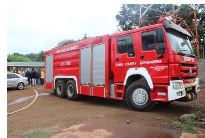
Refurbished Sino Fire Engine

tion." He said adding that, his department was at an advanced stage in fixing the Mann truck fire engine in order to ensure preparedness in responding to fire cases.