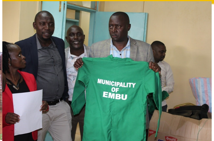
Lands CECM showcasing Embu Municipality Attire